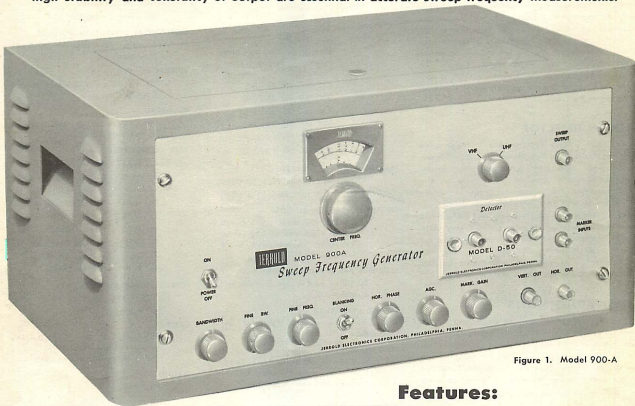
Figure 1. Model 900-A

Designed and engineered for use in the laboratory, production test . . . or wherever unusual versatility, high stability and constancy of output are essential in accurate sweep frequency measurements.