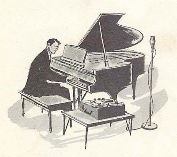
Never before could so much be recorded so well on a machine so small.